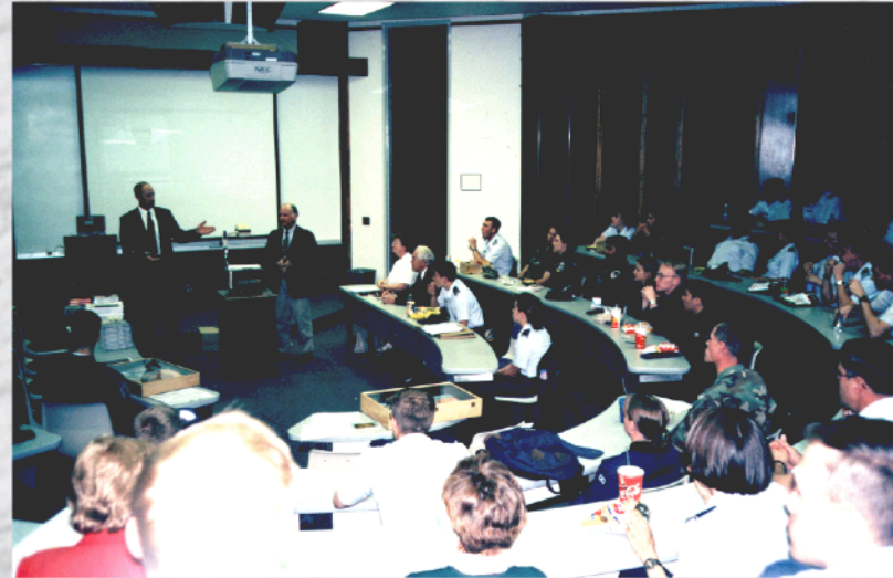
Christian professors hear lecture on Near East archeology