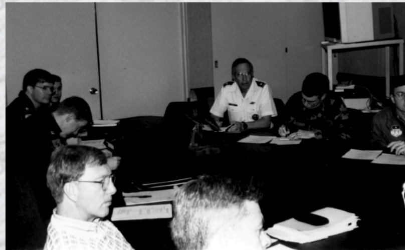
CLM board meeting at the Academy